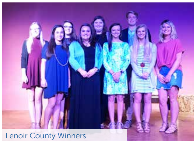
Lenoir County Winners