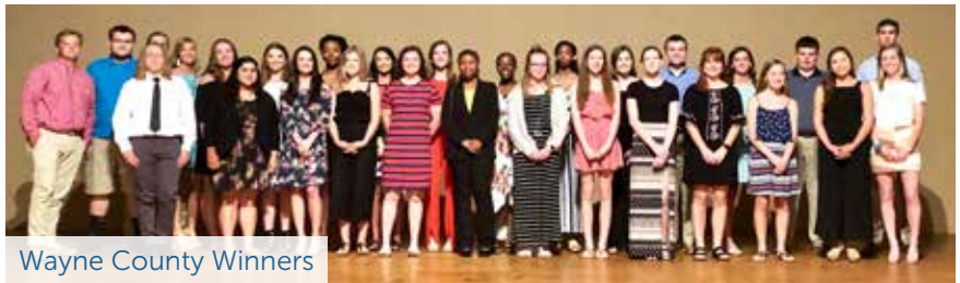
Wayne County Winners

Tri-County EMC awarded its first scholarships in 2001. Since that first year, TCEMC has awarded 921 scholarships totaling $395,250.