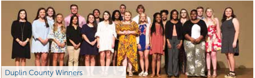
Duplin County Winners