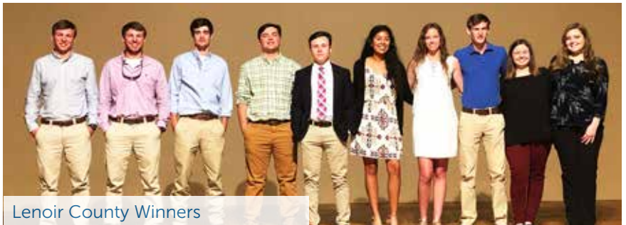
Lenoir County Winners